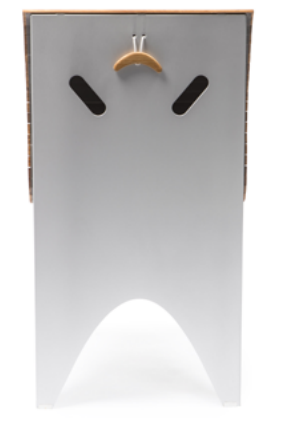
satin silver, teak tambour